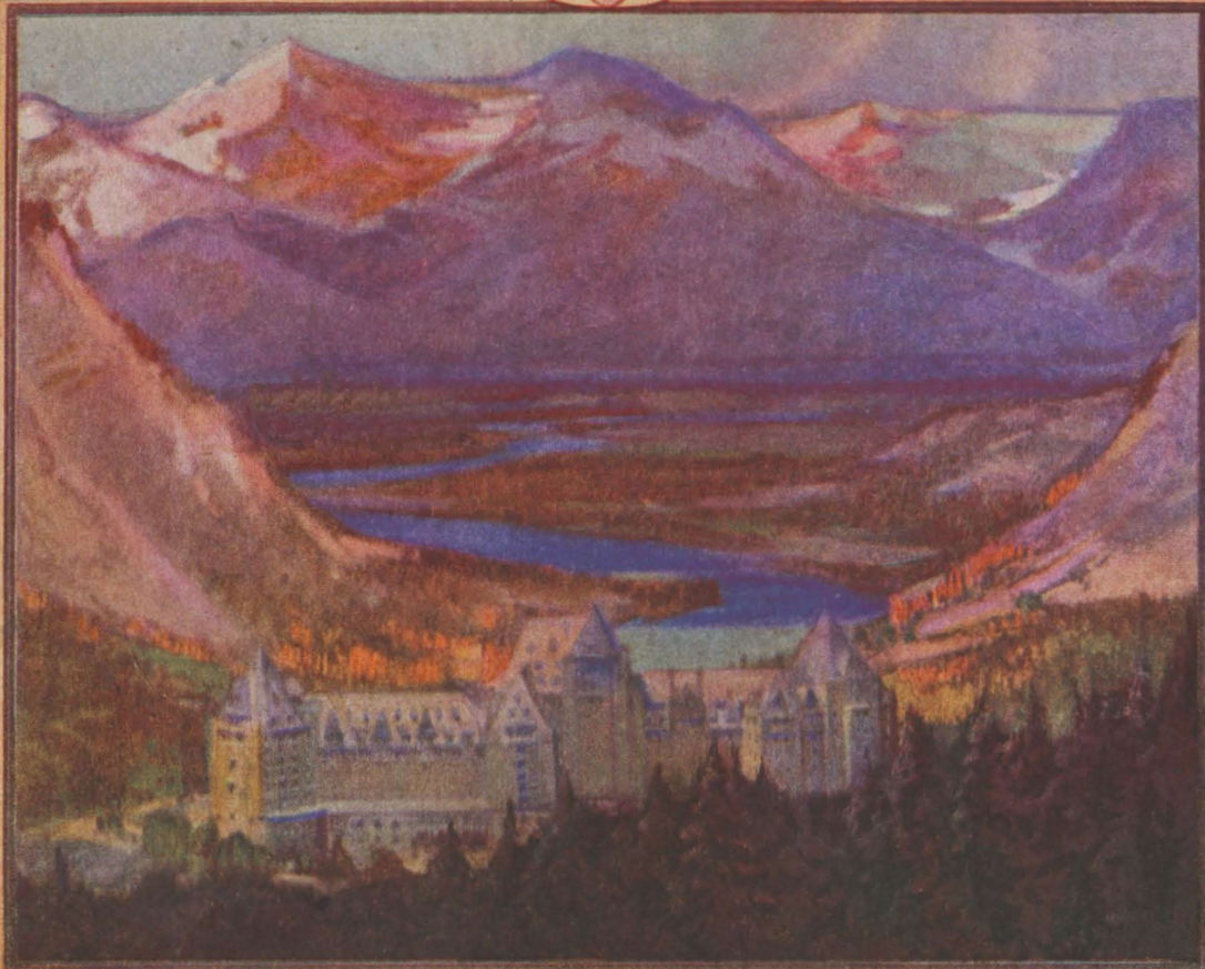
BANFF SPRINGS HOTEL, BANFF SPRINGS, ALTA.