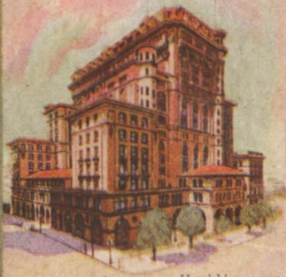
Hotel Vancouver Vancouver British Columbia