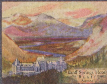
Banff Springs Hotel Banff Alberta