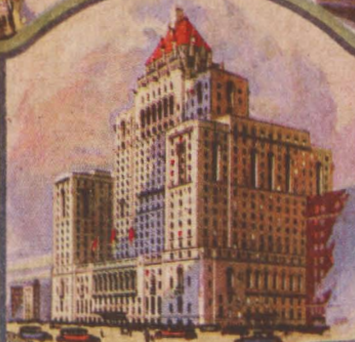
The Royal York Toronto Ontario