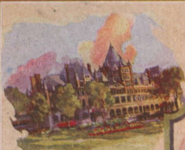
The Place Viger Montreal Quebec