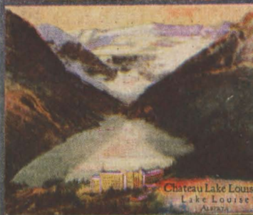
Chateau Lake Louise Lake Louise Alberta