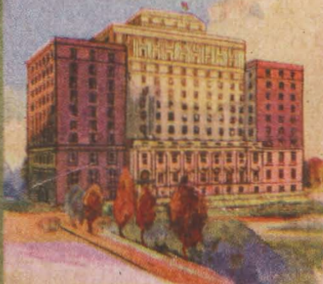
Hotel Saskatchewan Regina Saskatchewan