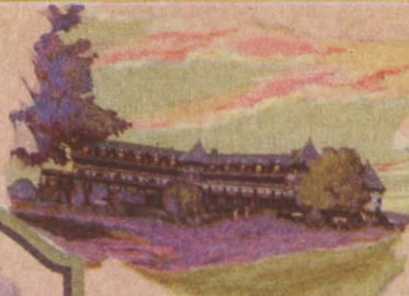
The Algonquin St. Andrews New Brunswick