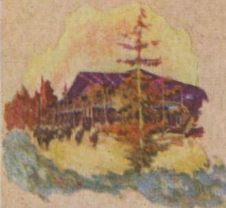
Emerald Lake Chalet Near Field British Columbia