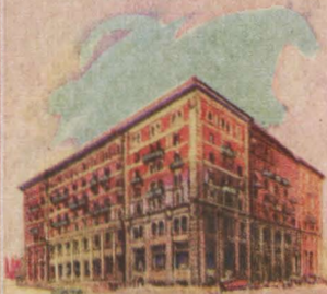
The Royal Alexandra Winnipeg Manitoba