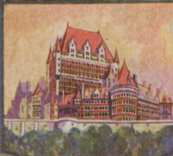
The Chateau Frontenac Quebec Quebec