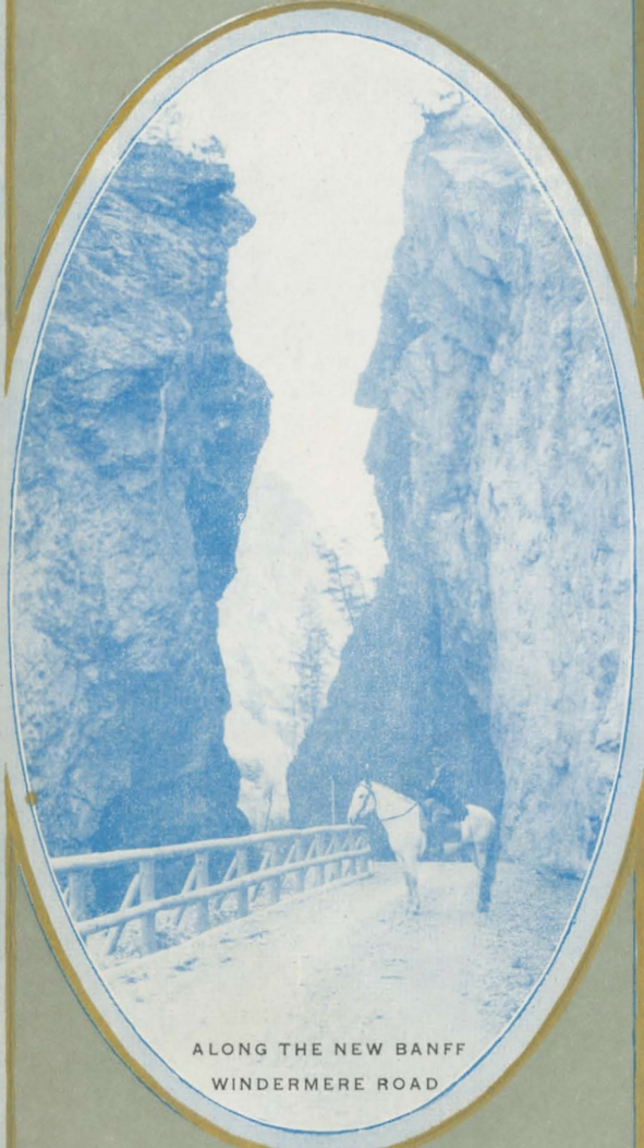
ALONG THE NEW BANFF WINDERMERE ROAD