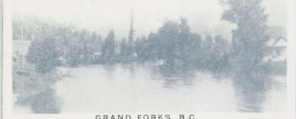
GRAND FORKS, B.C.