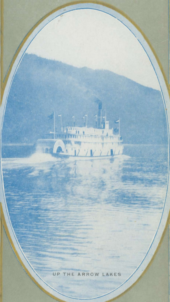
UP THE ARROW LAKES