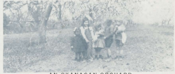
AN OKANAGAN ORCHARD