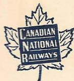
TABLE D'HOTE DINNERS

Pineapple Juice or Grapefruit Juice Soup, Tomato Vermicelli or Jellied Consomme