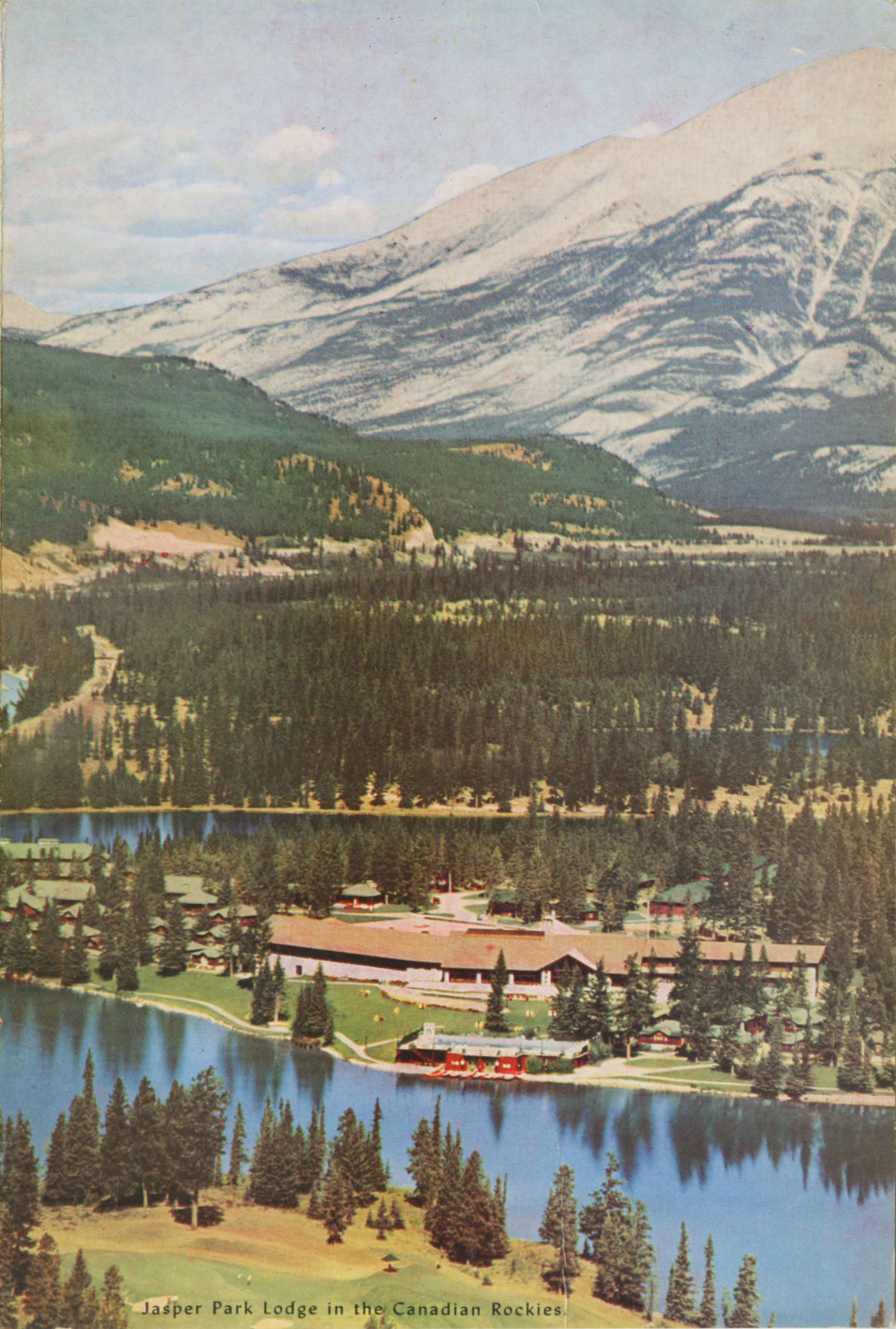
Jasper Park Lodge in the Canadian Rockies.