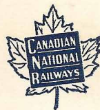
TABLE D'HOTE DINNERS

Pineapple Juice or Grapefruit Juice Soup, Tomato Vermicelli or Jellied Consomme