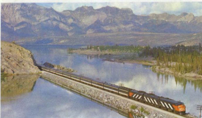
Cruising on land is fun in CN's comfortable trains. Good times, good food, and a chance to really see Canada. Sceneramic cars through the Rockies add an extra dimension to the view.