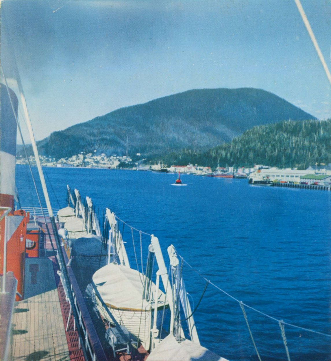
Ketchikan lies between the mountains and the sea