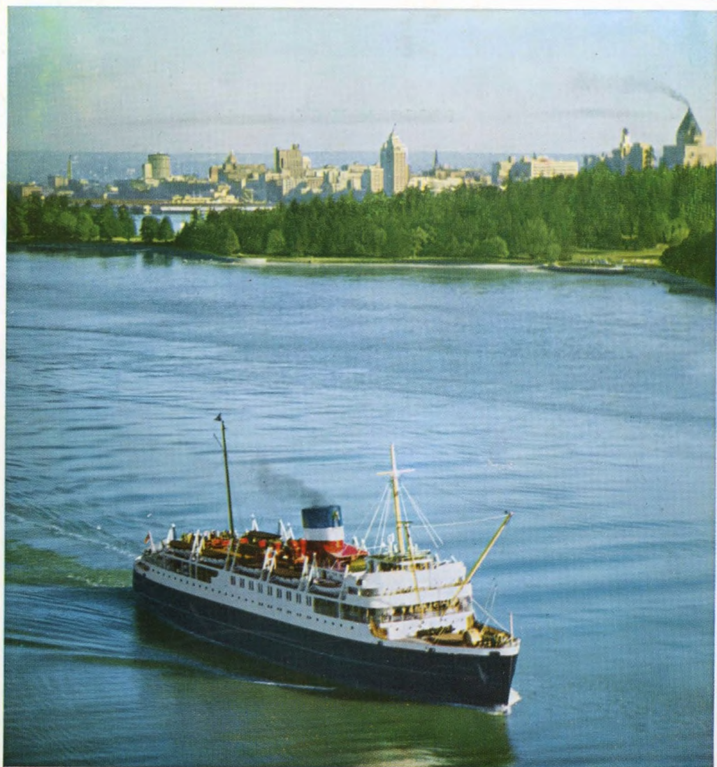
Leaving Vancouver harbor, with city in background