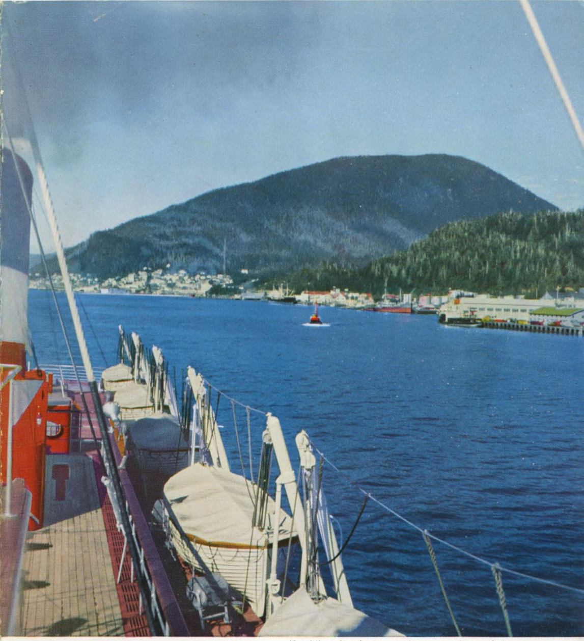
Ketchikan lies between the mountains and the sea