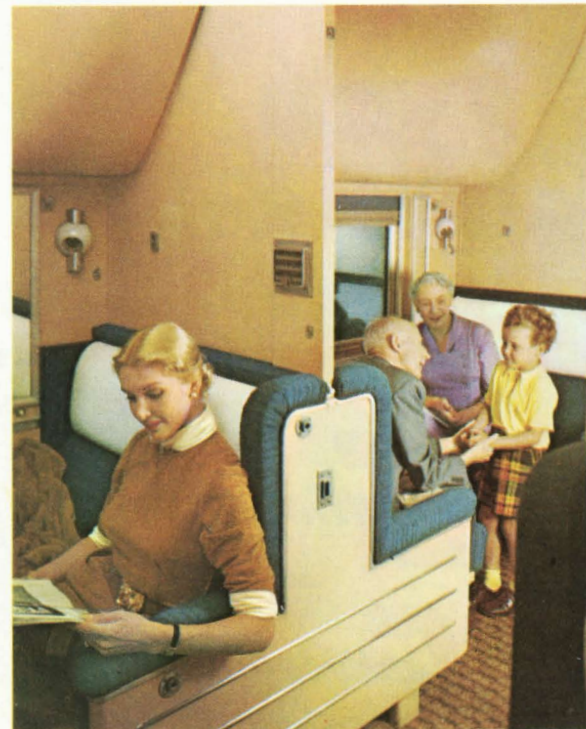
Section accommodations are inexpensive and flexible. Reserve an upper or lower berth, or have the whole section to yourself. Each contains comfortable beds by night — soft, deep-sprung seats by day.