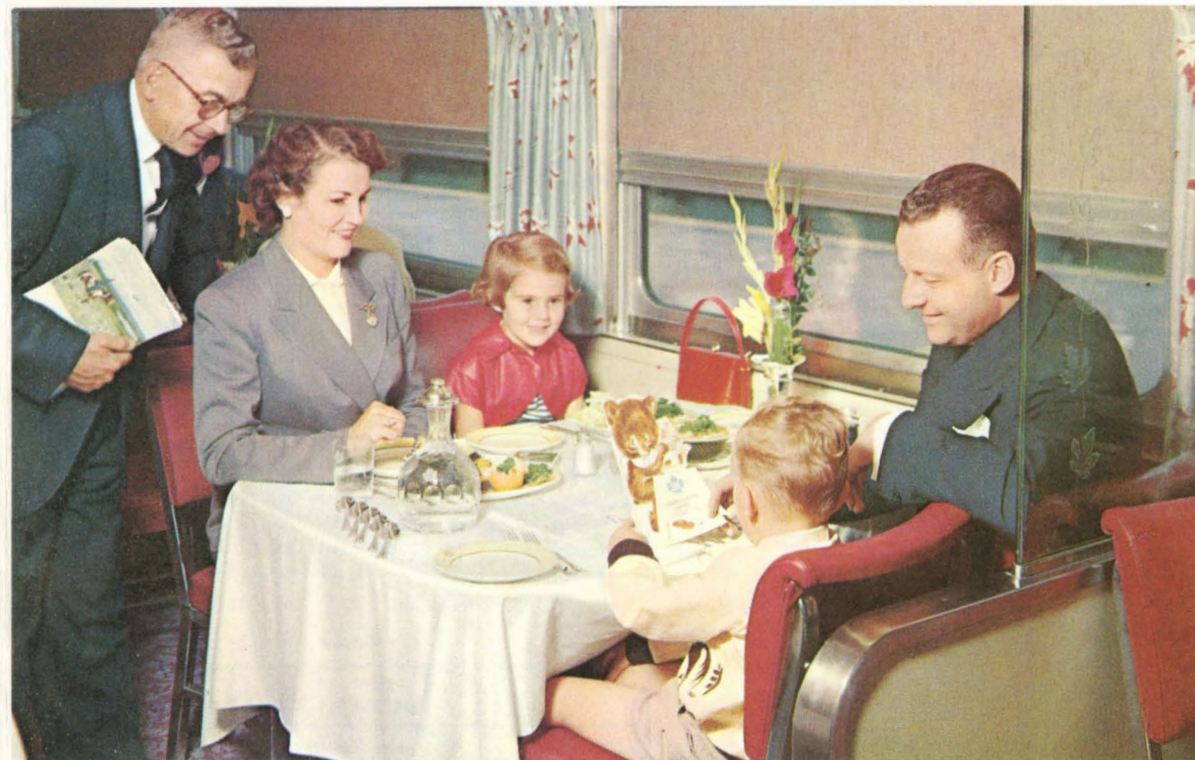
The dining car of the Super Continental offers the comfort and cuisine of a hotel dining room, plus a picture window view of Canada's rolling countryside.