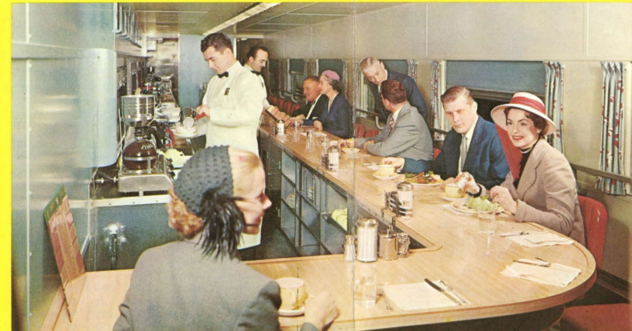
Dine on tasty meals in the Continental's dinette car. The menu ranges from light snacks to full-course meals, all moderately priced, expertly prepared, and served at an attractive counter.