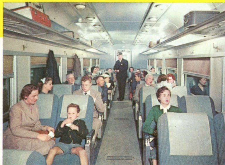
Modern coaches provide comfortable, economical transportation. Interiors are tastefully designed, and roller bearings, all-coil springs and foam-rubber adjustable seats guarantee miles of smooth rides.