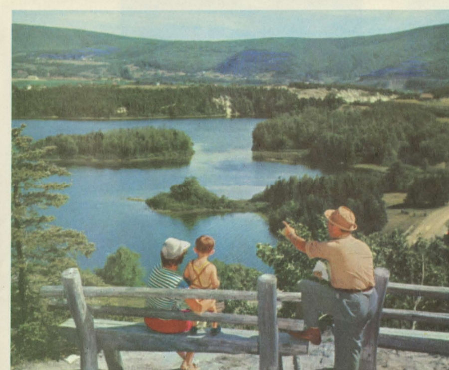
Folks never weary of the wonderful views to be seen in this corner of Canada