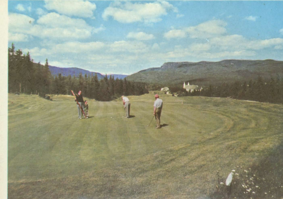
Ocean breezes make for cool golfing beneath sunny summer skies