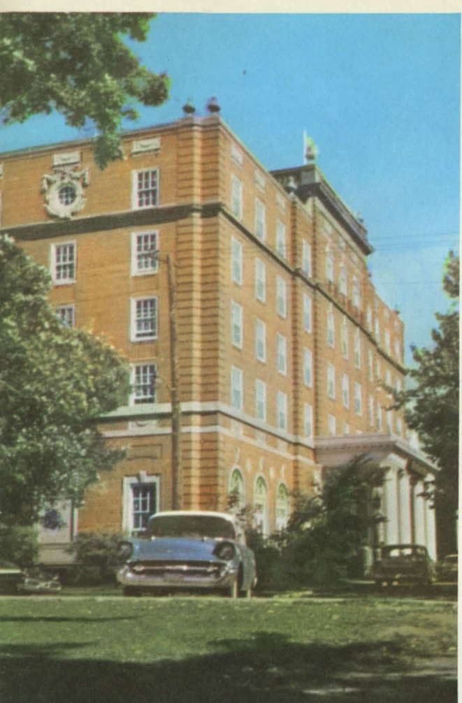
Visitors to Charlottetown will enjoy their stay at CNR's stately Charlottetown Hotel