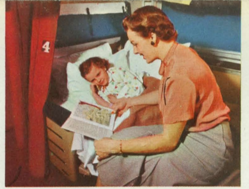
Families like the comfort and convenience of connecting bedrooms