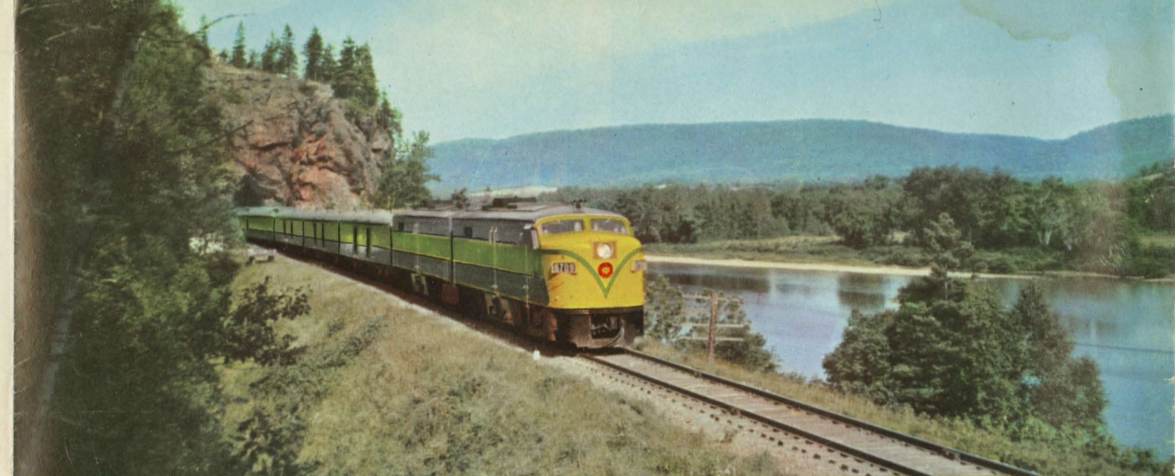
The Ocean Limited passes through scenic countryside on its way to Canada's east coast