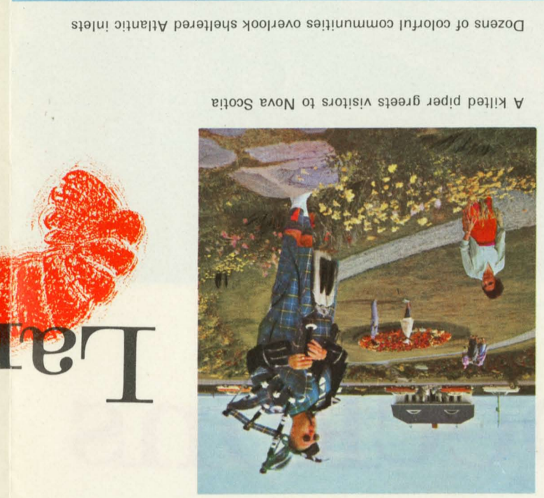
Dozens of colorful communities overlook sheltered Atlantic inlets