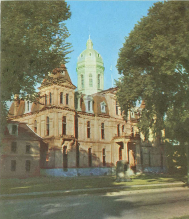
Fredericton, N.B. — seat of government and learning