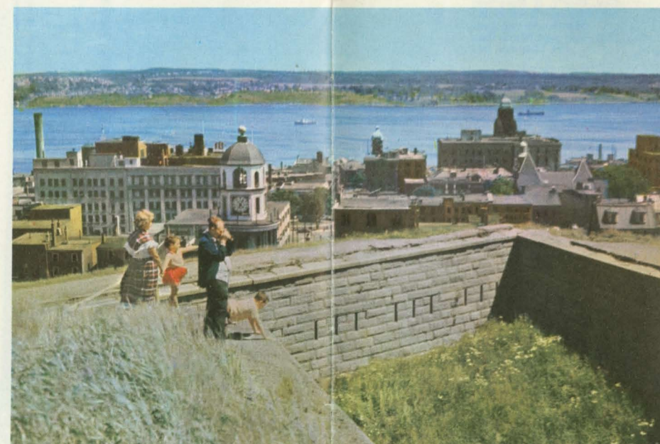
The fortress on Halifax's historic Citadel Hill mounts guard over this port city