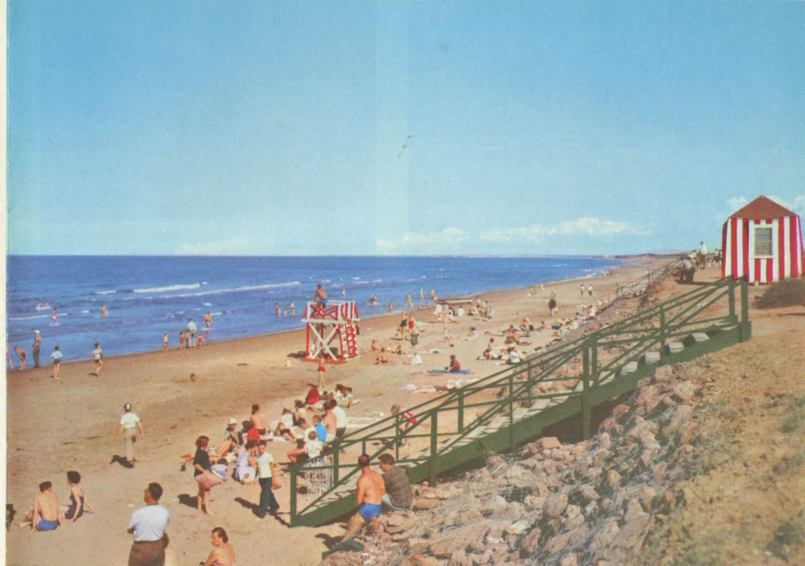
Sun yourself within sight of foaming breakers on any one of the Atlantic Provinces' many beaches