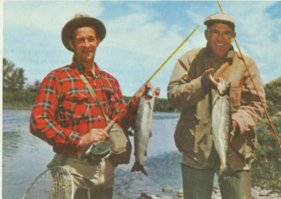
Streams and lakes in these provinces are well stocked with game fish