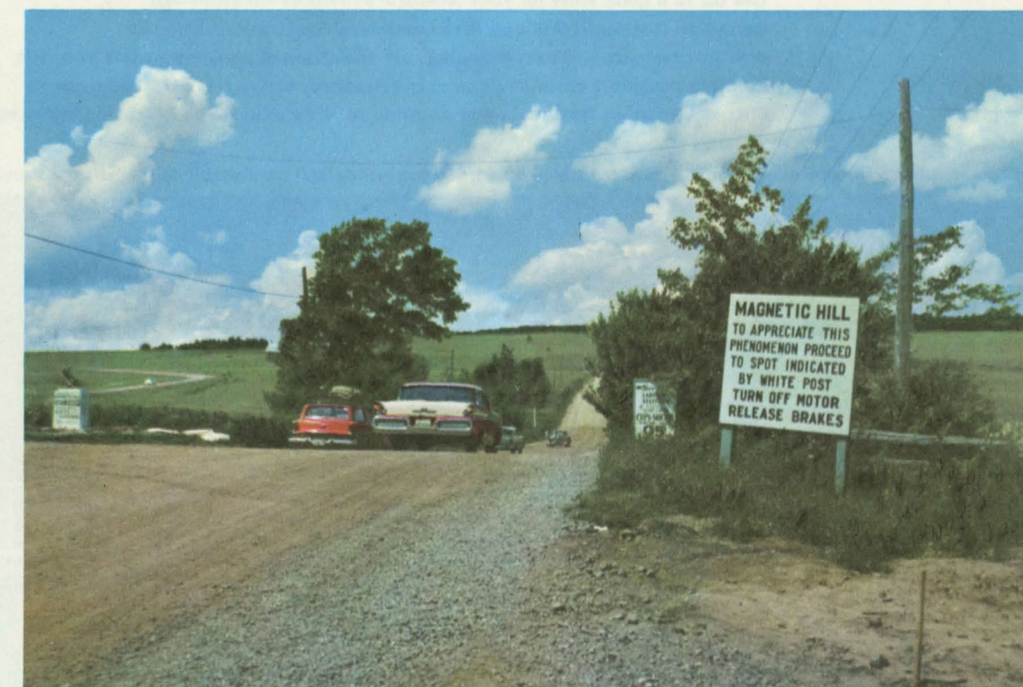
Gravity seems to reverse its rule on Magnetic Hill, near Moncton, N.B.

LET CNR BE YOUR HOST.....and guide you through these historic, romantic and scenic provinces