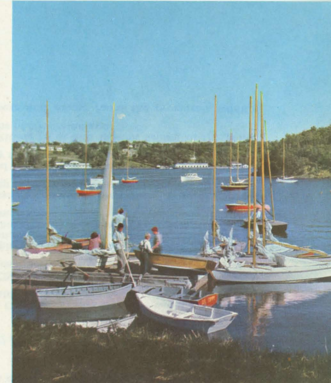
Sailing is keen sport on the eastern seaboard