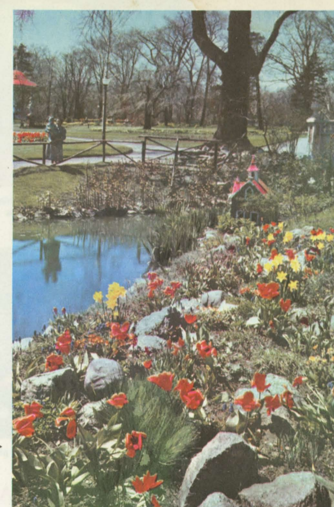
Halifax's Public Gardens display masterpieces of the gardening art