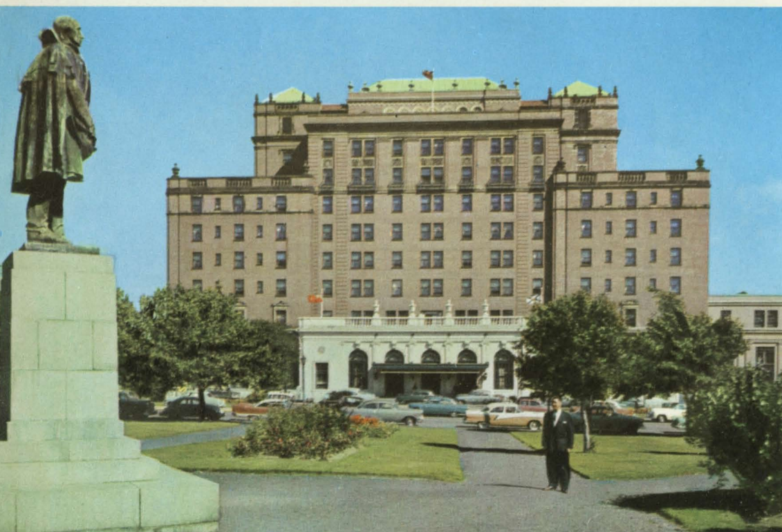
When in Halifax, make your headquarters at CNR's luxurious Nova Scotian Hotel