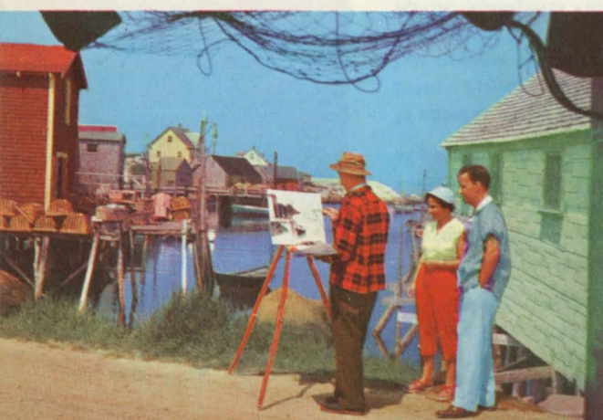
The Atlantic Provinces' marine beauty captivates artists and photographers