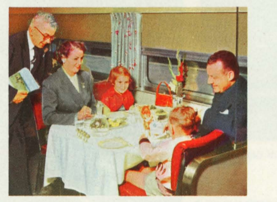
Dining car meals add to travel pleasure