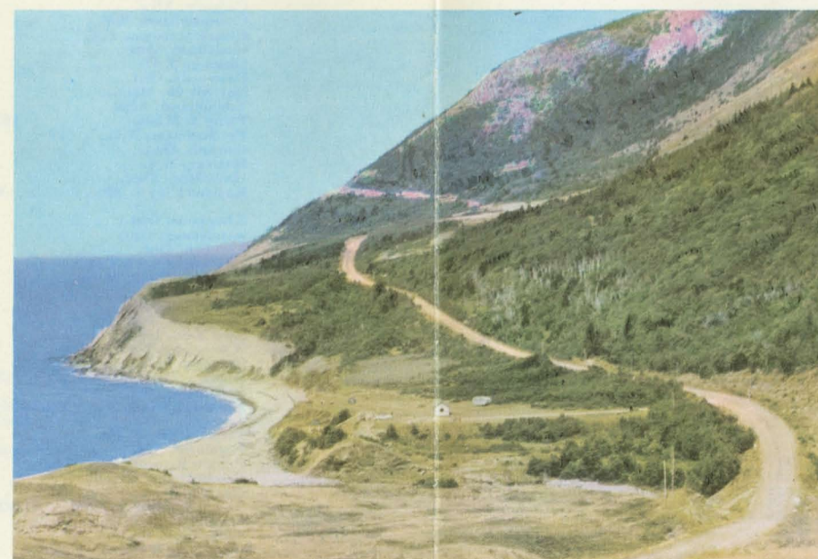
The spectacular Cabot Trail wends its way between Atlantic waters and the highlands of Cape Breton Island