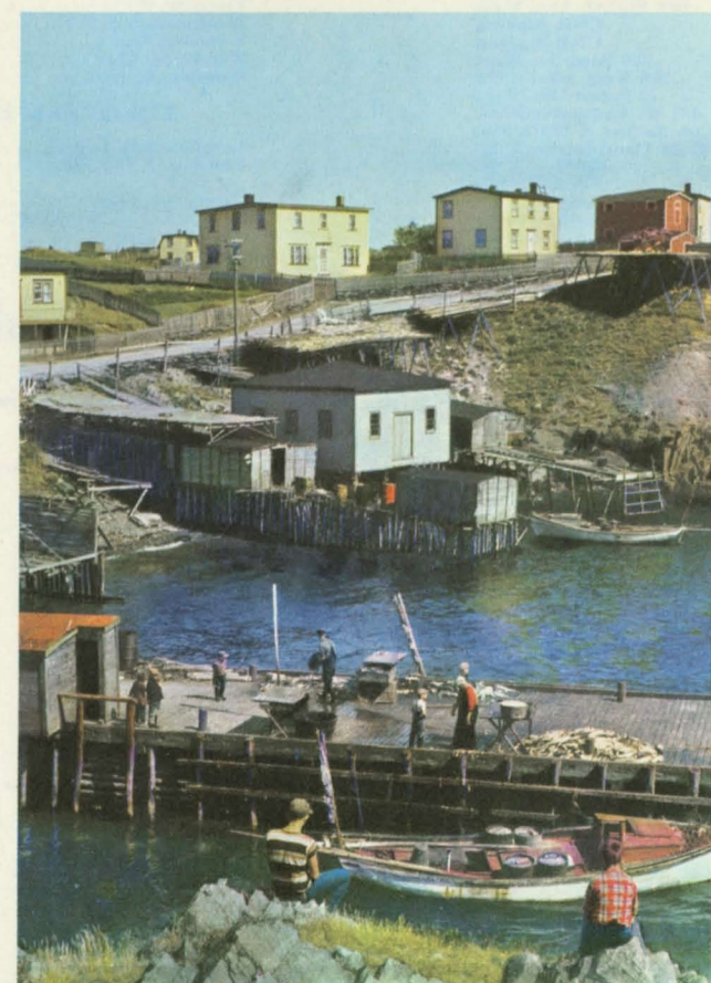
Remote "outports" crowd bays and coves along Newfoundland's coast