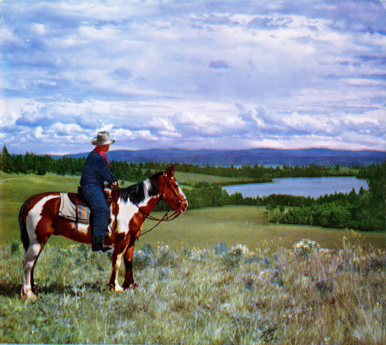
The Cariboo District of British Columbia