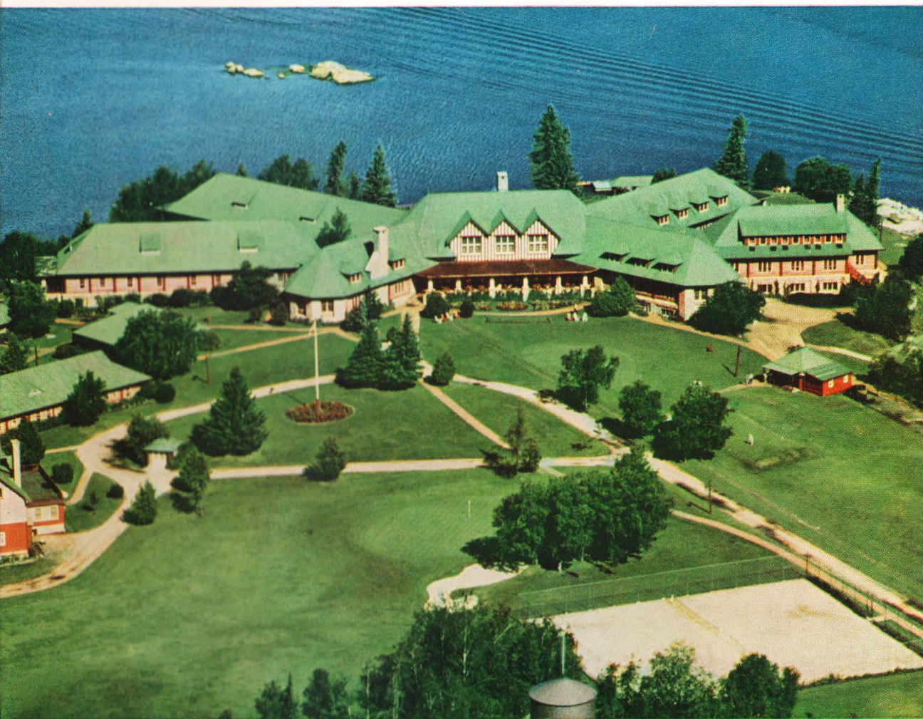
Minaki Lodge in the Lake of the Woods district, Ontario.