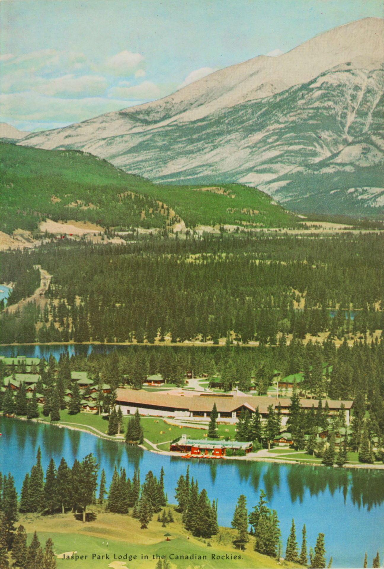
Jasper Park Lodge in the Canadian Rockies.