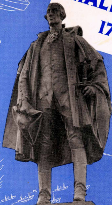
EDWARD CORNWALLIS FOUNDER OF HALIFAX