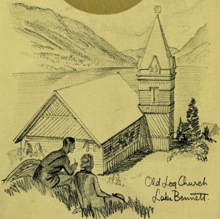
Old Log Church Lake Bennett.