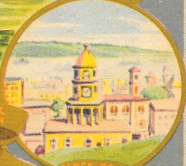
CLOCK TOWER CITADEL HILL HALIFAX, N.S.