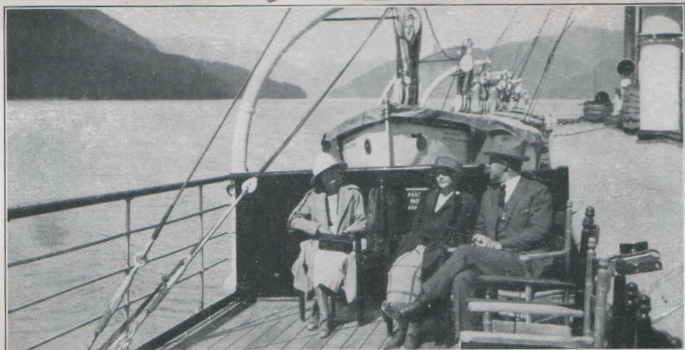
ENJOYING THE SCENIC FEATURES FROM THE DECK OF THE S. S. "PRINCE RUPERT" AND S. S. "PRINCE GEORGE" EN ROUTE TO ALASKA